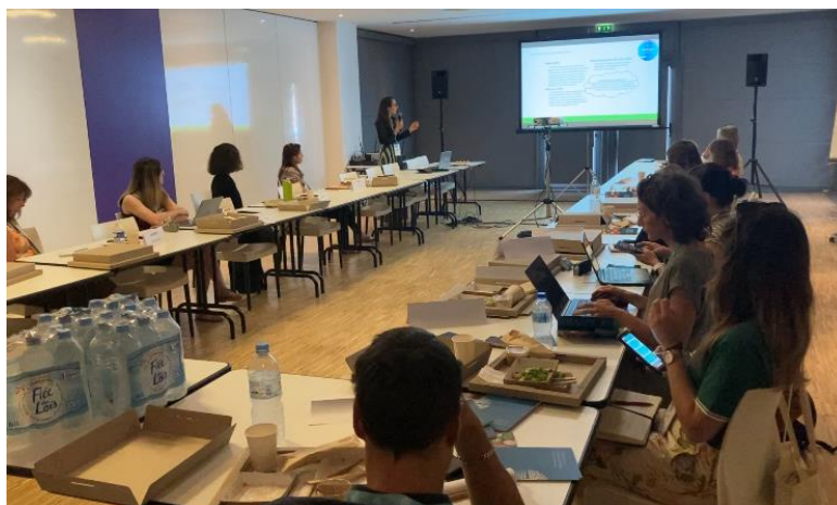
Figure 2. EQVEGAN seminar at La Rochelle (France), 15 Jun 2022.

Participants, mainly from Food Industry (10 persons), had a fruitful discussion with Gemma and were very interested on data and methods for Life Cycle Assessment. Additional images here and LinkedIn post . This activity was also part of the European vocational skills week 2022 .