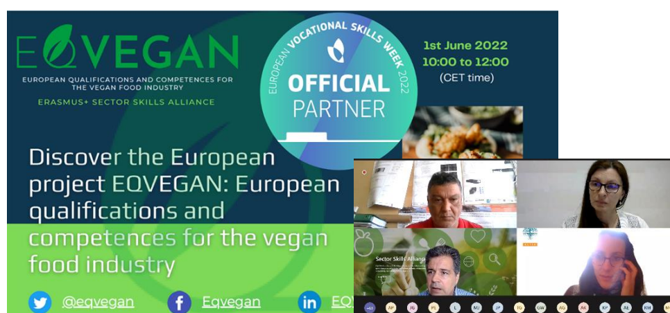
Figure 1. EQVEGAN webinar organised 1 st June.

The agenda of the event was the following: