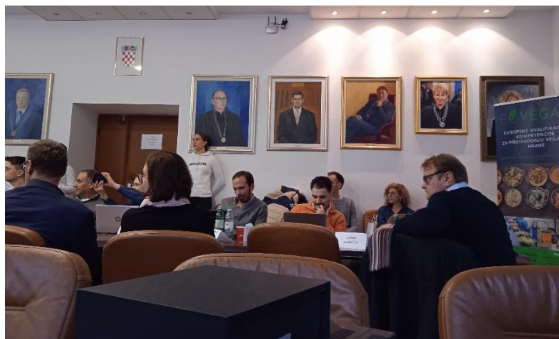
Figure 5. Face-to-face meeting with Croatian stakeholders and EQVEGAN partners.