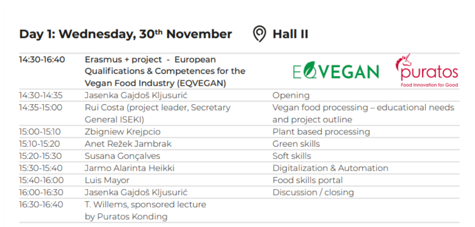
Figure 6. EQVEGAN roundtable at the PBN congress.

Estimate number of attendees was 50 persons from Higher Education institutions and 20 food professionals. A photo gallery can be found on the EQVEGAN website, and social media posts .