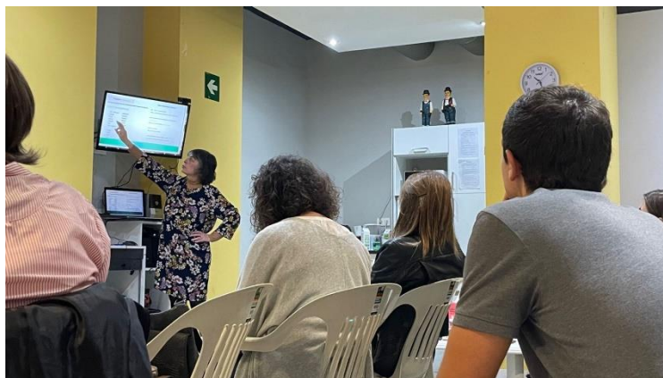
Figure 3. EQVEGAN hybrid event organised by ACTAE (Vitoria, Spain), 12 Nov 2022.

It was in Spanish and had an hybrid format, with 12 participants face-to-face and 35 participants online. Photo gallery and LinkedIn post .